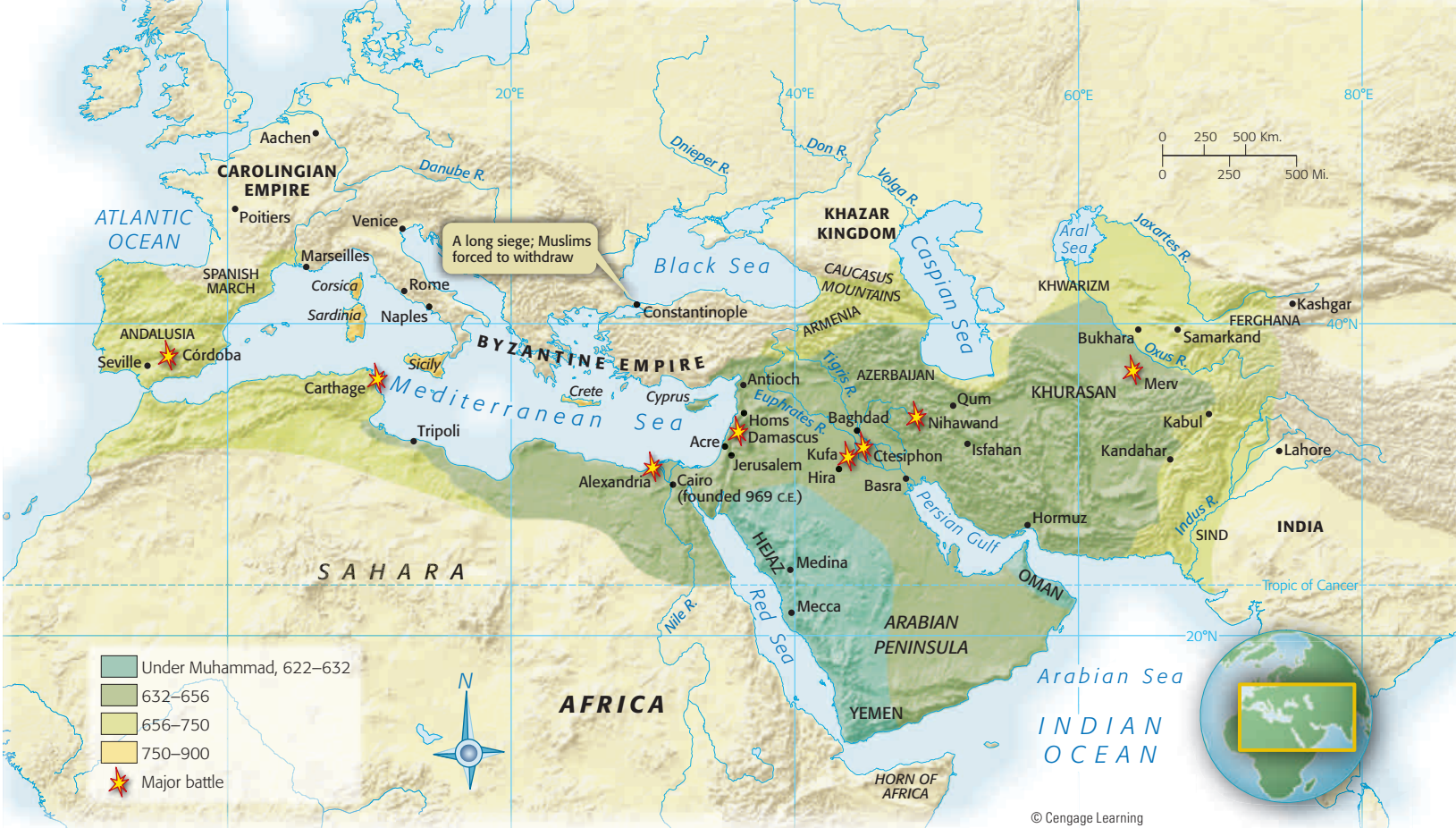
MAP 8.1 Early Expansion of Muslim Rule Arab conquests of the first Islamic century brought vast territory under Muslim rule, but conversion to Islam proceeded slowly. In most areas outside the Arabian peninsula, the only region where Arabic was then spoken, conversion did not accelerate until the third century after the conquest.